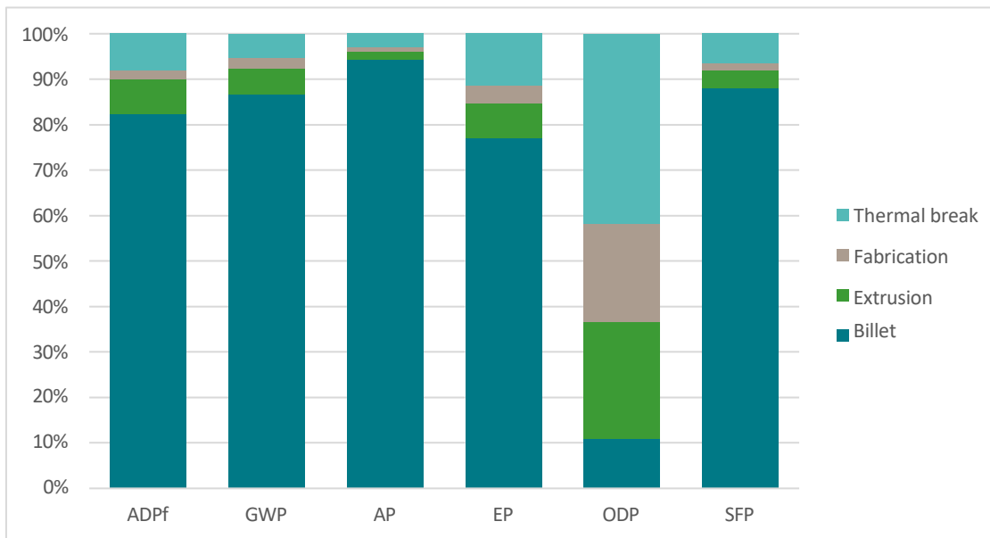
Figure 2: Relative contribution of upstream processes

According to ISO 14025 and ISO 21930:2017